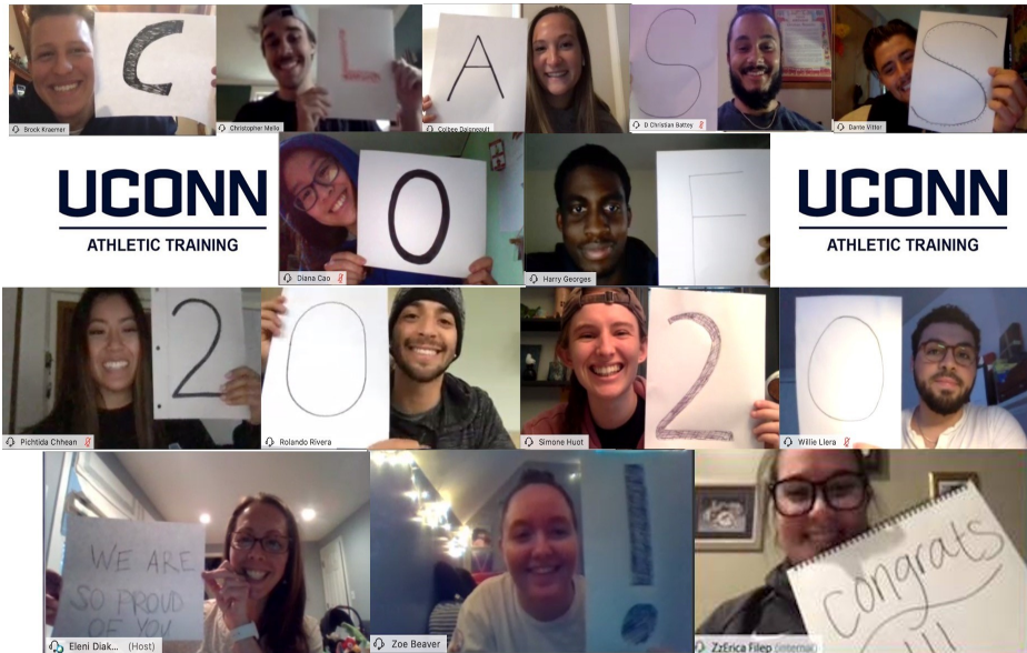
The class of 2020 during one of their final classes in the Spring 2020 Semester